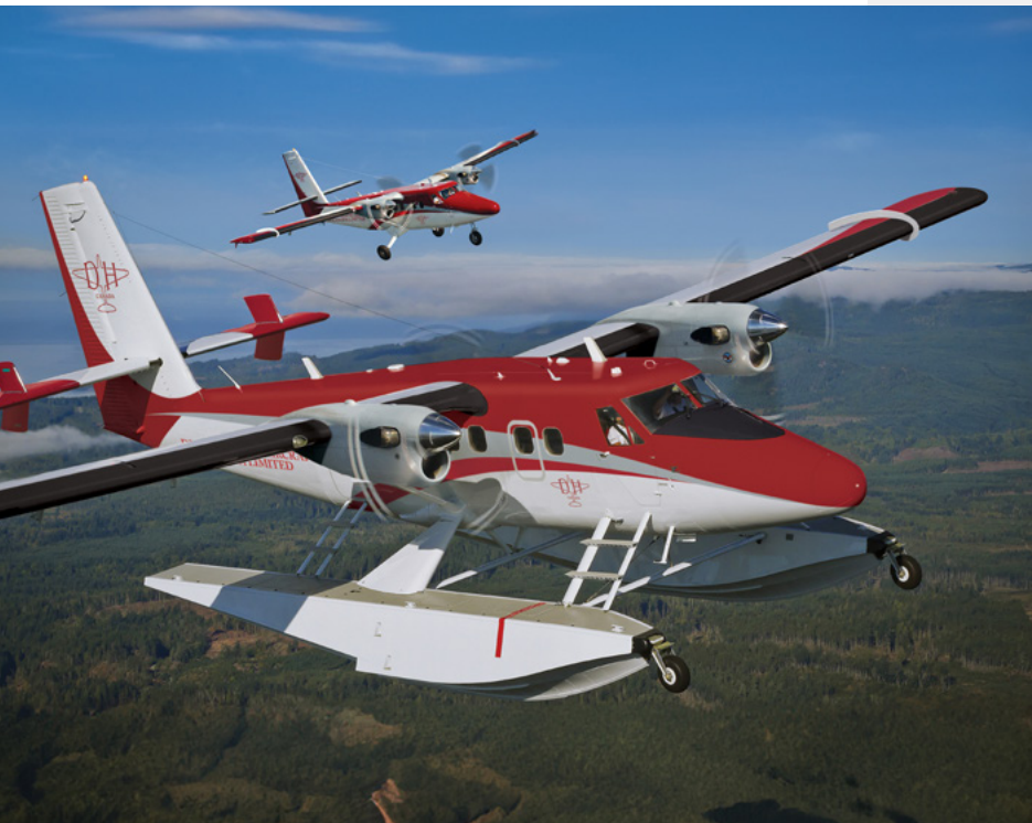
DHC-6 TWIN OTTER CLASSIC 300-G