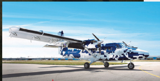
DHC-6 TWIN OTTER GUARDIAN